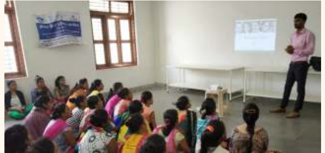
Ambuja Cement Foundation, Surat