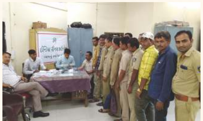
GSRTC Bus Stop, Kadi.