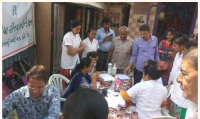
Detection Camp, Bhavnagar