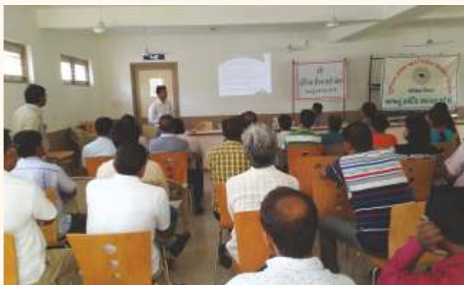
GSRTC Divisional Office, Mehsana