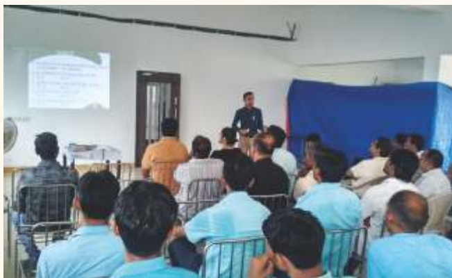
Bayer Crop Science Limited, Himmatnagar