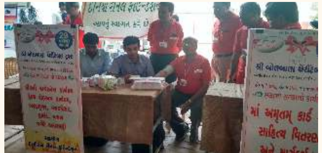
Exhibition Stall, Junagadh