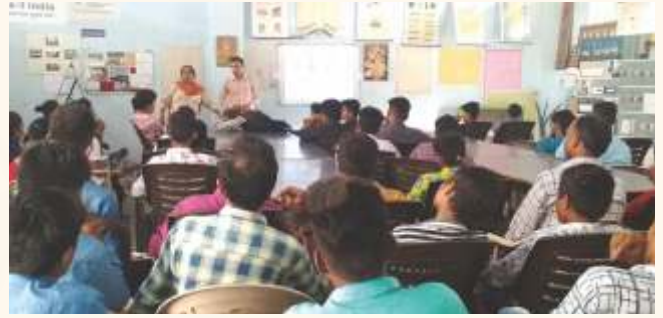
Sadvichar Parivar, Uvarsad Village