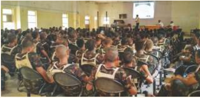
Police Training Centre, Junagadh