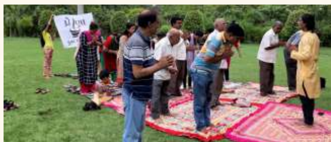
Yoga Programme at Vadodara

'Prerana' programme is like a festival for me, and I am sure, not only for me but for all my brethren who enjoys this bi-monthly programme across the state must have the same feeling.