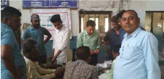
GSRTC Divisional Workshop, Himmatnagar