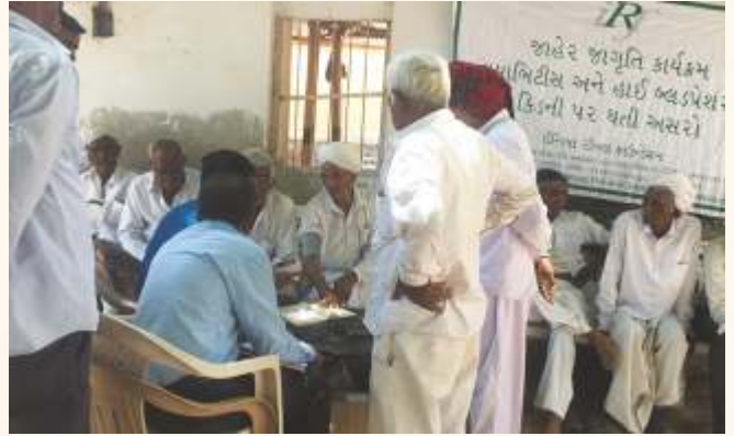
Screening Camp at Khoda Village

During the quarter 136 awareness and screening camps were held.