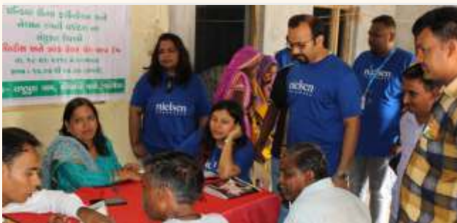
Screening Camp at Rajpura Village